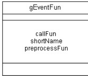
Figure 6: The gEventFun Class.

the preprocessFun slot is a list of all preprocessing functions that must be called before the callback function.