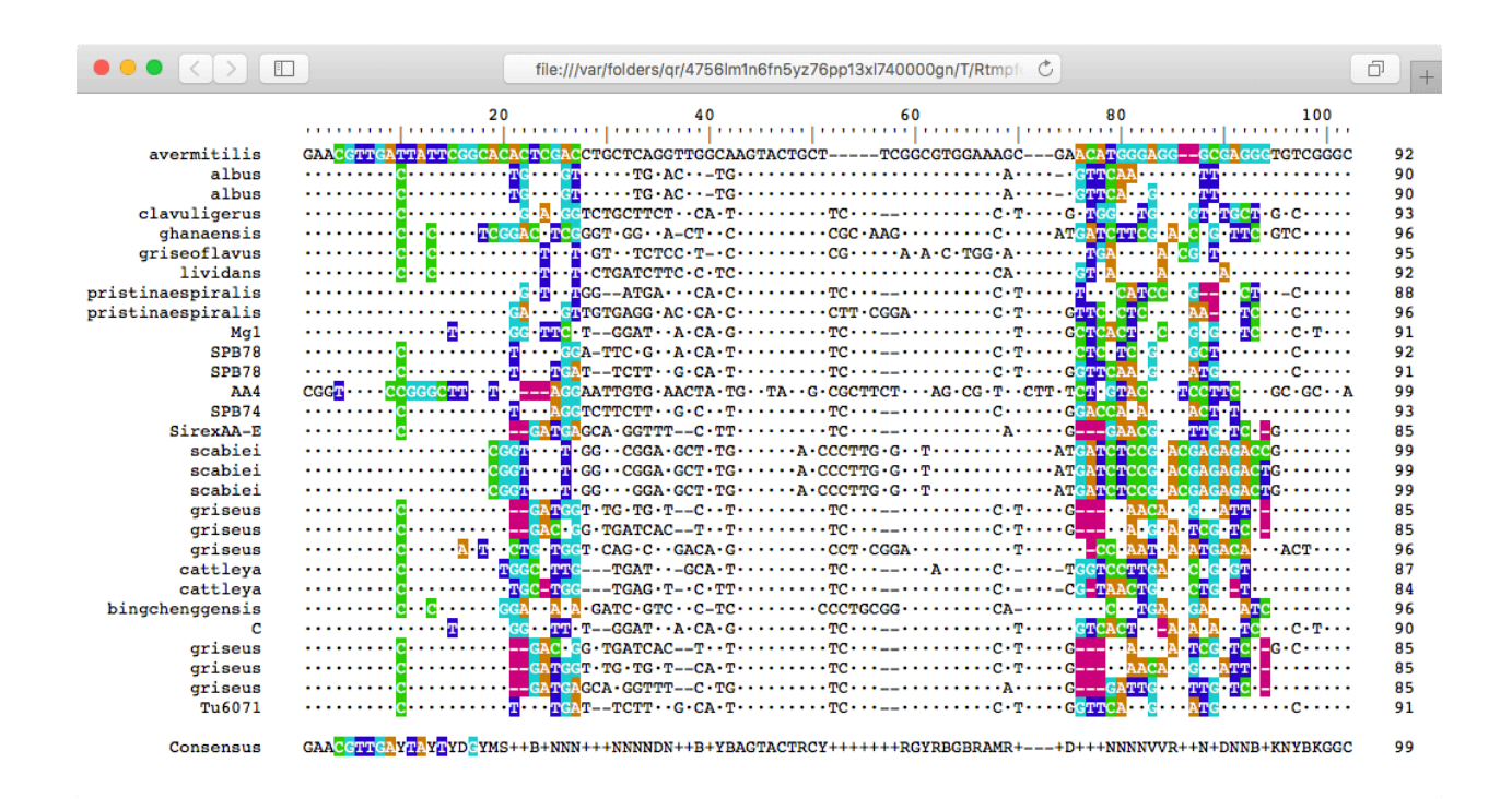
Figure 2: Amplicon with the target site for each primer colored