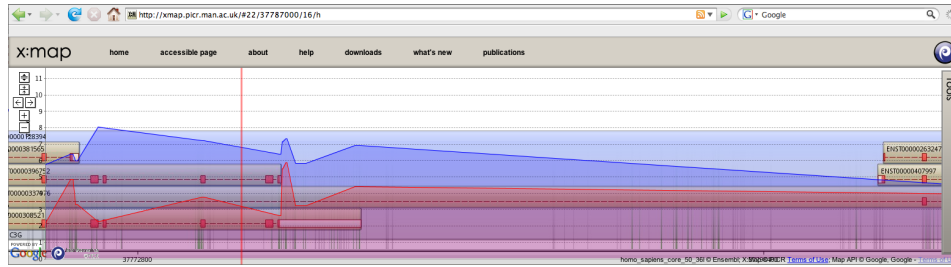
Figure 5: Multiple plots on the same graph