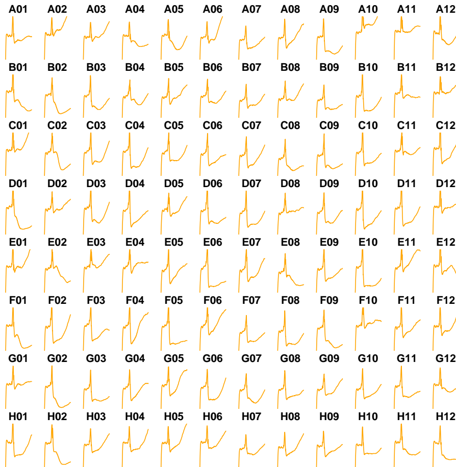
Figure 3: Plate view of a 96-well E-plate from a RTCA assay run.